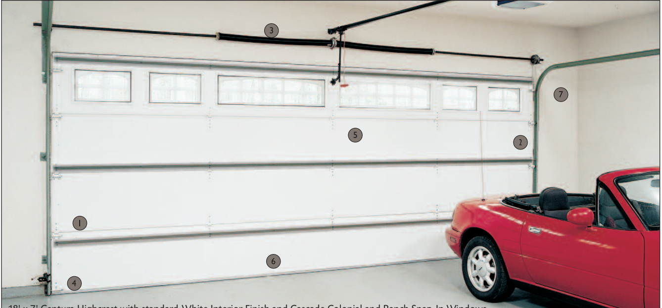
18' x 7' Centura Highcrest with standard White Interior Finish and Cascade Colonial and Ranch Snap-In Windows